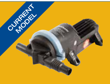
AK2050 Pump head assembly