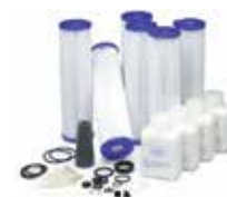
Extended Cruise Kit

Katadyn reserves the right to modify products