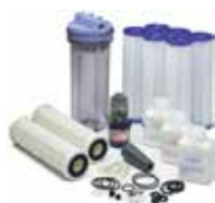
Preventative Maintenance Kit