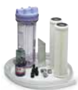
Silt Reduction Kit

For waters with high levels of suspended matter, e.g. in shallow anchorage, we would recommend you use an additional prefilter. This additional filter is finer (5 microns - 1 micron = 0.001 mm) than the standard filter (30 microns) and is placed after it. A booster water pump (12V/0.8 A/h) is also provided. This pump compensates for the loss through the second filter and increases water production. We would also recommend the prefilter kit when the PowerSurvivor is not installed under the water line and when it is in constant use to increase the intervals between servicing.