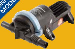
AK2050 Pump head assembly