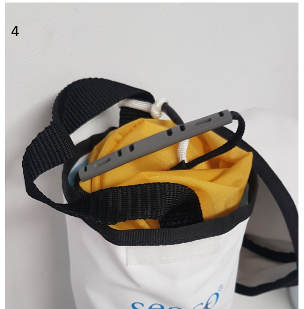
After replacing the pouch, make sure the firing lanyard cord with handle is placed on top of the pouch.