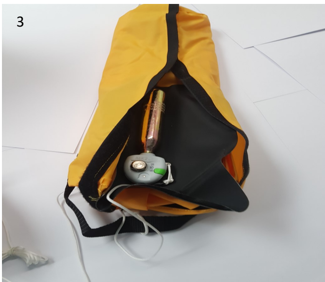
Place the folded Danbuoy in the pouch with the firing lanyard with handle exiting the top ready for use.