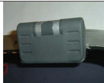
Hinge of type fitted with screw

In 2008 the hinges were changed from using M4 fastenings as hinge pins to M5 fastenings as hinge pins. These do not fit the M4 hinge and on pre-2000 units made from 1997 to 2000 hinges cannot be changed.