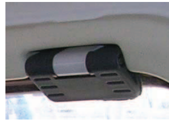
Hinge of type fitted with pressed / staking process

In June 2000 the portlight was changed to use screwed on hinges and handle catches that are user serviceable. The hinges and handle catches sometimes have packers under them to control the seal compression.